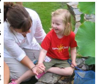
Coco goes pond dipping