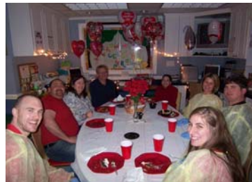
Parents gathered for a Valentine's day dinner provided by Carrabba's

Love is in the air on 5200! To celebrate Valentine's day, patients enjoyed an afternoon filled with laughter, cookie decorating and doing a heart-themed craft project. The Connection was full of decorations and the air was filled with the smell of freshly baked cookies.