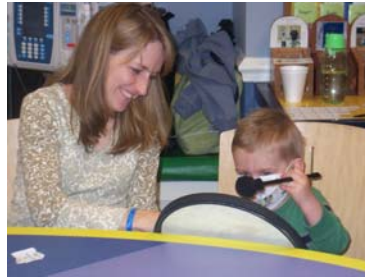
Cal and his mom play the drum in music therapy