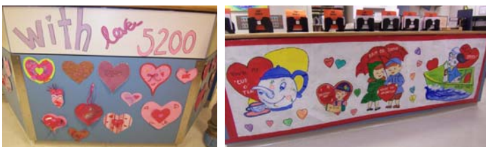
Some of the amazing artwork that is hanging on 5200, courtesy of the decorating committee and their helpers!